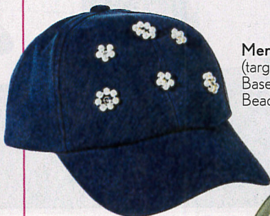
Merona, $13 (target.com, Women's Baseball Cap with Beaded Flowers Navy)

"Leave your statement necklace at home and turn heads with jewels on your hat," suggests Silver. He asserts that the glitzy cap can work for a laid-back cocktail occasion. Throw on a bodycon dress and a moto jacket for a look that reads totally confident and maximally sexy.