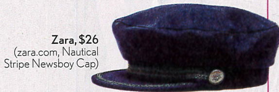
Zara, $26 (zara.com, Nautical Stripe Newsboy Cap)