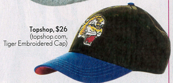
Topshop, $26 (topshop.com, Tiger Embroidered Cap)