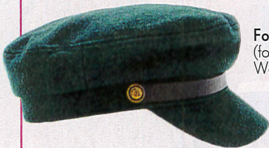
Forever 21, $13 (forever21.com, Anchor Wool-Blend Cabby Hat)

A buttoned cap lends a dose of tough-gal edge to an outfit, says Silver. And he notes that the vintage-style buttons help draw attention to pretty eyes. Sport with a neutral blouse and pleated leather miniskirt for a weekend look that's party-perfect.