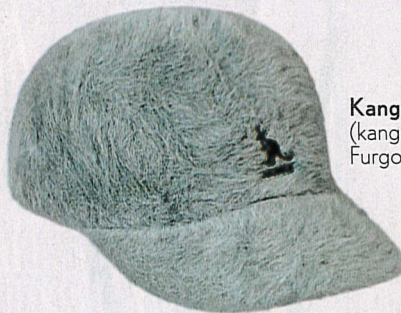
Kangol, $60 (kangolstore.com, Furgora Links)

The '80s strikes back with #OldSchoolCool caps. "The bold patches and angora textures of the '80s have gotten a modern athleisure update with a baseball-cap style," says Silver. Kick back with a bomber jacket, leggings and trainers for a look that can go from the gym to a night out.