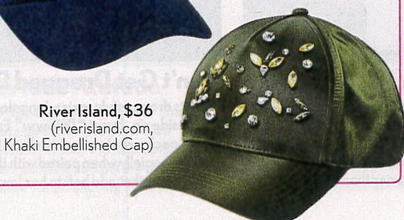
River Island, $36 (riverisland.com, Khaki Embellished Cap)