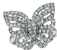
Celebrity, $46 (overstock.com, Sterling Silver Pave-Set Round-Cut Butterfly Ring)