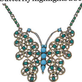
Betsey Johnson, $48 (betseyjohnson.com, Boho Betsey Butterfly Pendant)