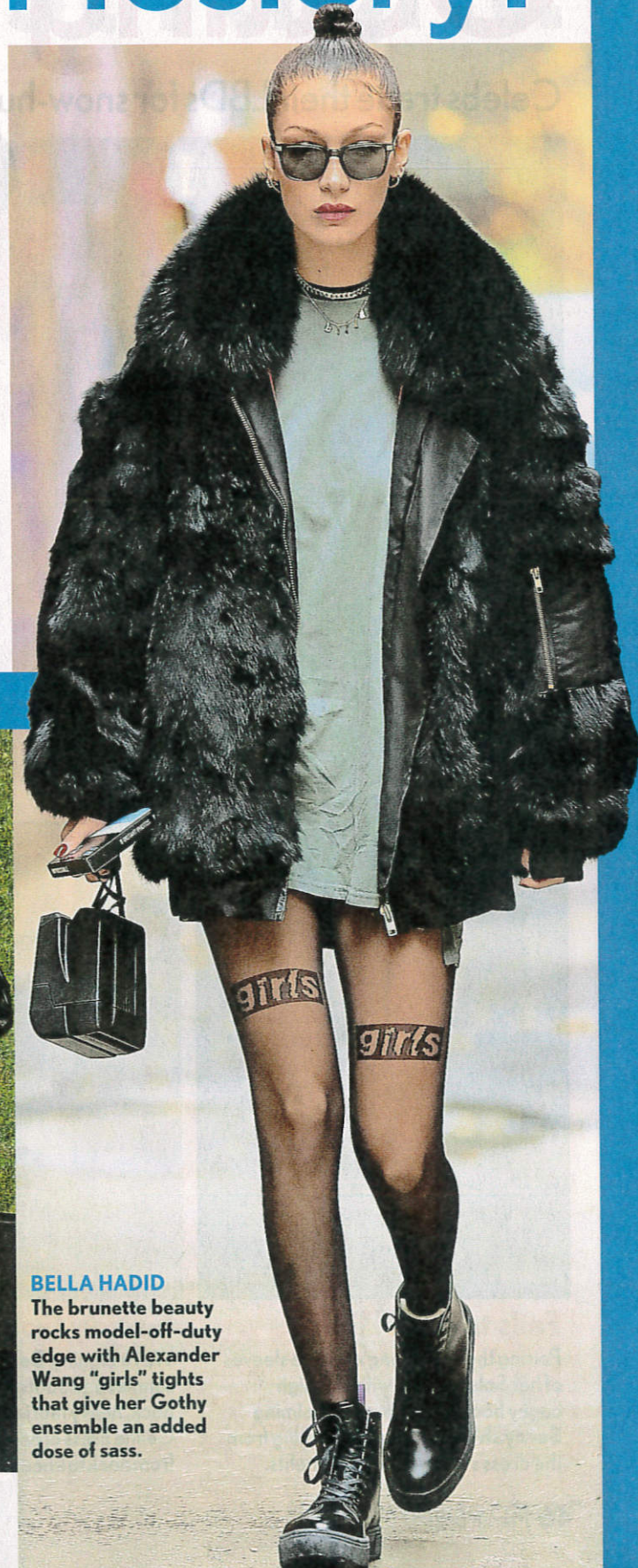
BELLA HADID The brunette beauty rocks model-off-duty edge with Alexander Wang “girls” tights that give her Gothic ensemble an added dose of sass.