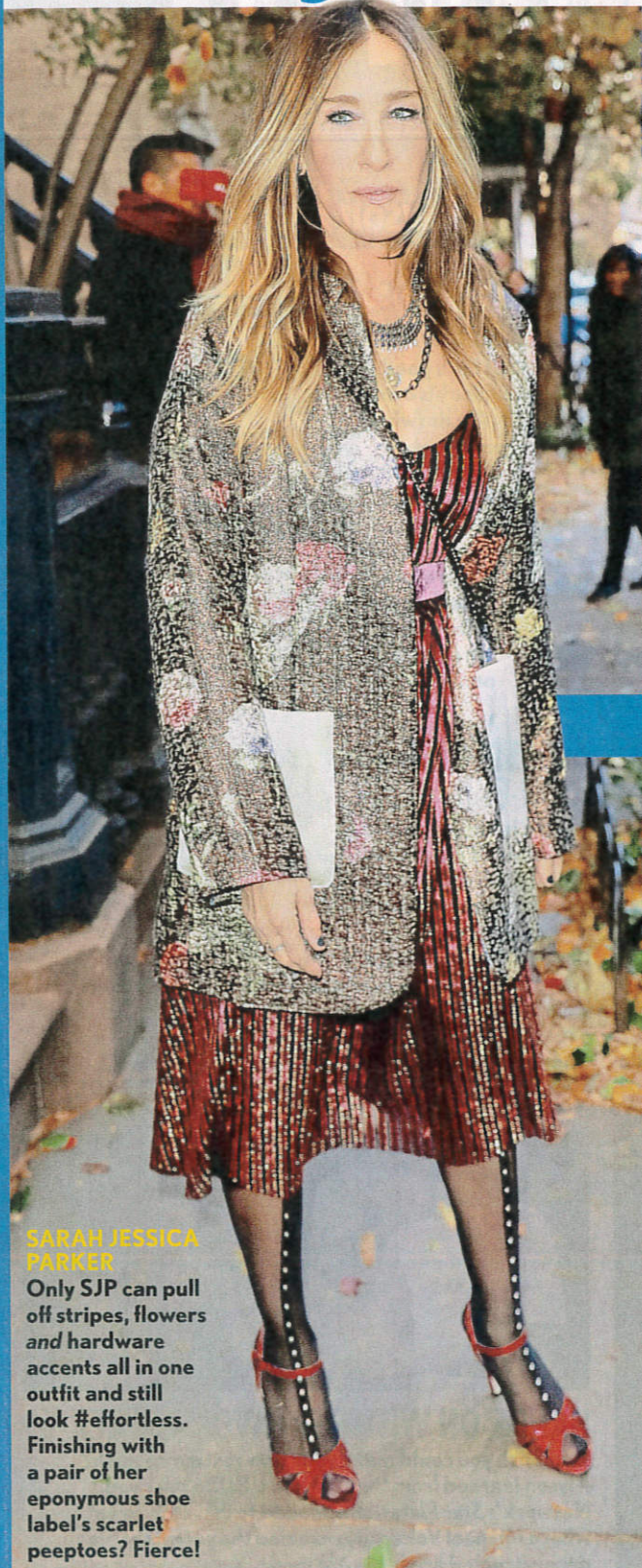
SARAH JESSICA PARKER

Only SJP can pull off stripes, flowers and hardware accents all in one outfit and still look #effortless. Finishing with a pair of her eponymous shoe label's scarlet peeptoes? Fierce!